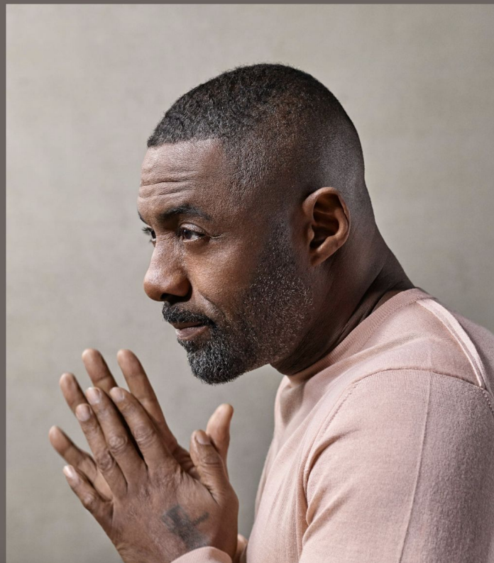
Idris Elba — 2HR SET

Entrepreneurs Photographers Restaurants Musicians Small Businesses Fashion Designers