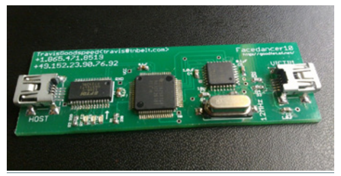
Figure 4: The Facedancer board

Additionally, beyond the venerable microkernel model, a number of research projects have explored techniques to isolate device drivers in the name of system stability [2, 6, 10]. Microsoft has also started moving USB drivers to userspace. Though these measures won't eliminate vulnerabilities, they will help contain side effects of potentially buggy drivers.