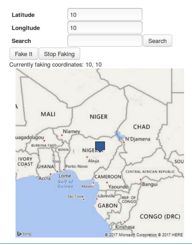
Figure 2: Snapshots of the Fake Location extension—an example browser extension allowing users to fake their locations

A wide set of techniques can be used, mostly for a server to geolocate clients [5]. These enable a server to infer a client's geographic location from hints obtained from browser-generated HTTP headers such as preferred language or time zone. Loca-